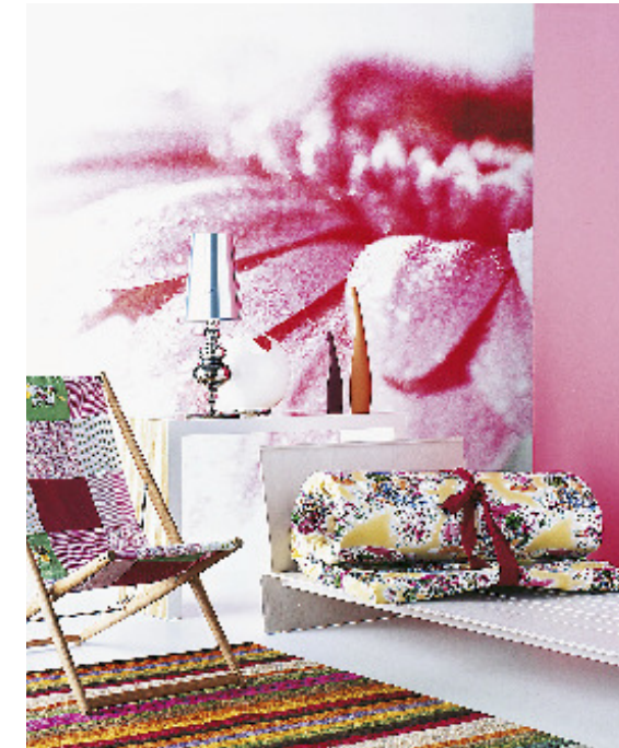
WALL-SIZE ART Left: The digital era has created infinite potential for art at home. Photographs such as this can be blown up and printed directly onto a wall, just like wallpaper. Images on floor surfaces can work well, too. Provide your own photographs or choose from a catalogue. For more ideas, visit www.bubblecreative.com .

Art is initially a decorative investment and should be viewed in the same light as other decor you would buy for your home. If, however, it goes beyond the merely aesthetic, it's important to familiarise yourself with the necessary skills to recognise a good buy.